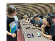
※The app version is used at school festivals and hands-on events. Many people, with or without experiences of playing musical instruments, enjoy music.