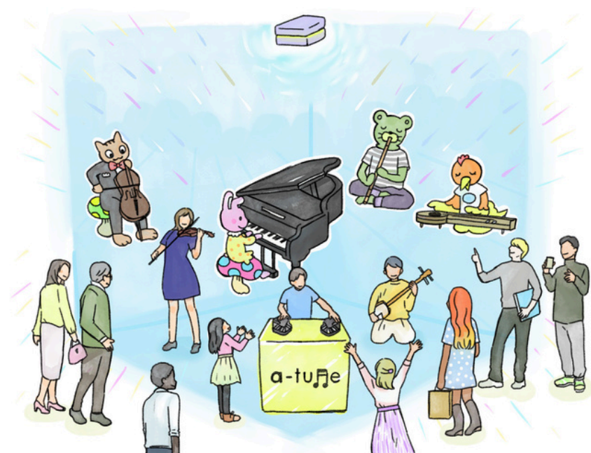
※Illustration of "e-Symphony"

Students who are unable to attend on the day of the performance can participate by video or recording, so that anyone can join "e-Symphony" and become a part of "UNITY".