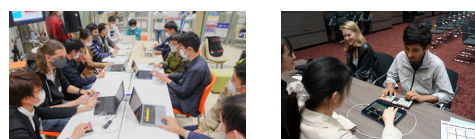
※The app version is used at school festivals and hands-on events. Many people, with or without experiences of playing musical instruments, enjoy music.

To provide equal opportunities for people to interact using music, we would like people who are not good at playing instruments or who have no experience to participate in "e-Symphony" as performers of ParoTone.