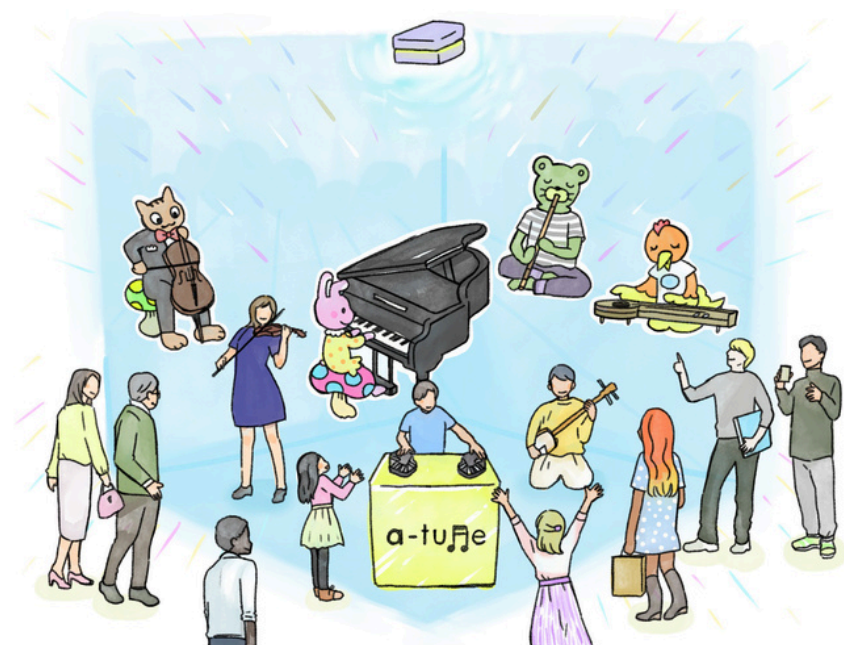
※Illustration of "e-Symphony"

Students who are unable to attend on the day of the performance can participate by video or recording, so that anyone can join "e-Symphony" and become a part of "UNITY".